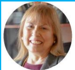
Tricia Powell Commissioner District 1